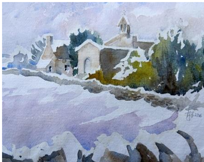
Christmas Greetings and a Happy New year